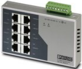
Ethernet Switch, 8 TP RJ45 ports, automatic detection of data transmission speed of 10 or 100 Mbps (RJ45), autocrossing function

Please be informed that the data shown in this PDF Document is generated from our Online Catalog. Please find the complete data in the user's documentation. Our General Terms of Use for Downloads are valid ( http://phoenixcontact.com/download )